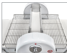
Movable Safety Guard