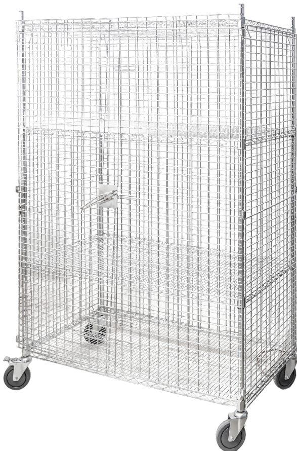
*Assembled Cage Depicted

Easily assembled when needed and disassembled for storage, this mobile security cage provides an on demand space for all your secure storage needs. From tools and equipment to documents and paperwork, this mobile cage will keep your items safely secured.